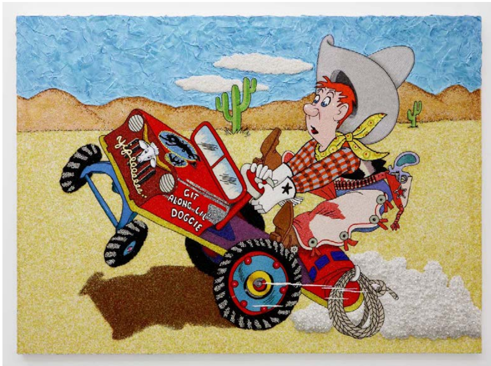
Farhad Moshiri, Yipeeee (2009), hand-embroidered beads and acrylic on canvas

Following the Báez exhibition, Diaz brought the first solo museum exhibition of Iranian artist Farhad Moshiri to The Warhol. Moshiri's work offers a fascinating insight into American kitsch from an Iranian perspective, addressing "contemporary Iran's traditions and historic isolationism, and simultaneously acknowledging the powerful appeal and influence of Western culture in his homeland." Diaz explained that the significance of the exhibition changed in light of the travel ban, as logistics grew more complicated. The travel ban adds a degree of irony to the exhibition, which reflects imported American pop and kitsch images through an Iranian cultural lens.