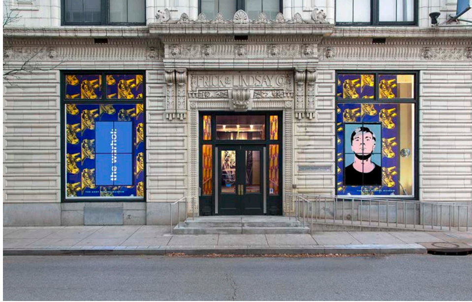
Front façade of The Andy Warhol Museum.

The Andy Warhol Museum fits within a simple narrative at first glance—the largest single-artist museum in North America devoted to presenting and circulating globally the most complete collection of Warhol’s work. In fact, Andy Warhol’s legacy lends itself to the plurality of narratives and identities embodied in the museum. For many of the museum’s visitors, the seven-story prewar industrial building has become a place of pilgrimage, a destination to pay homage to one of the most enduring American success stories. While the museum rotates these patrons through thoughtfully crafted pairings of archival material from Warhol’s life with iconic paintings, film, and interactive art, the staff of the museum simultaneously work to manifest the complexity of Warhol’s legacy through a range of local community engagement initiatives and exhibitions of contemporary artists who are in dialogue with his work. Here we encounter an appropriate contradiction—the artist who rejected his place of birth to pursue wealth and fame has, in his death, catalyzed the creation of a space for both newcomers and the marginalized in his home city of Pittsburgh.